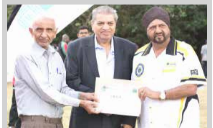
C.C.H.U. receives a Certificate of Appreciation from Lions Club of Nairobi Host

The Shree Cutchi Gujarati Hindu Union, Nairobi conducted a CSR Activity by supporting the 10th Annual Lions Club of Nairobi Host's Sports and Fun Day for Children with special needs on 17th February 2019.