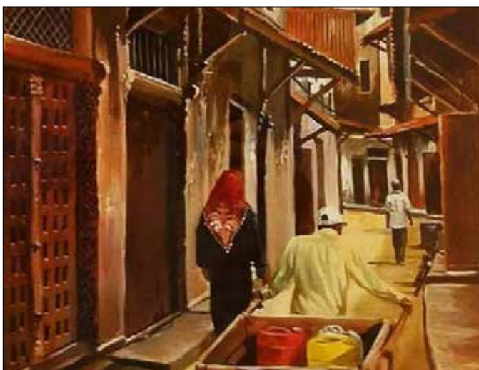
ABOVE: A photo of the Old Town Mombasa. Photo; Courtsy. LEFT: Old Town Painting By Zuber Bakhrani.