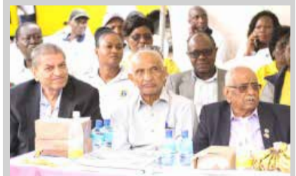
C. C. H. U. representatives witness and enjoy the Annual Sports and Fun Day