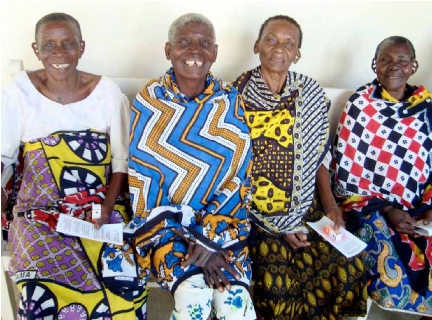
Senior Social Committee - VOC Nairobi