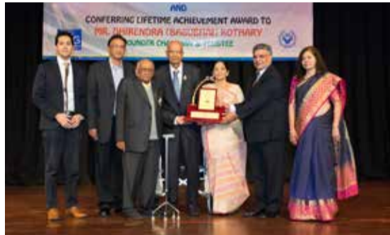
Jain Social Group, Nairobi Committee