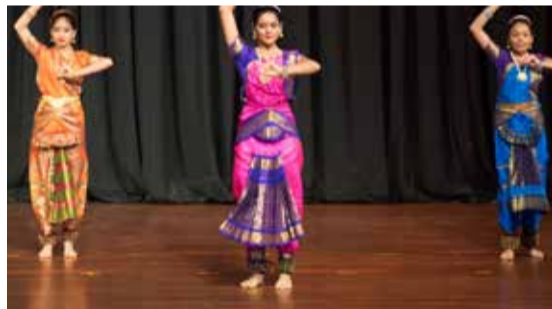
Dancers from Kamini School of Dancing