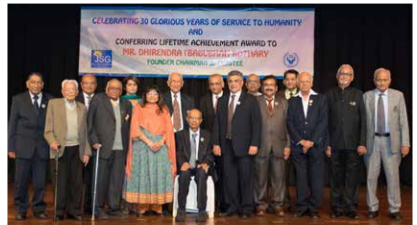
Jain Social Group, Nairobi Committee

The event was entertained by girls from the Kamini School of Dancing and Sarakasi Dancers. The guests later relished scrumptious dinner