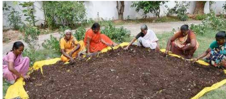
Tamil Women drying manure prior to collection.

Mind you, I am not talking of gated communities, but streets filled with up to a hundred families. One can say our very own Nyumba Kumi Initiative back home could be a smaller version of RWAs in Chennai. Anyway, what actually