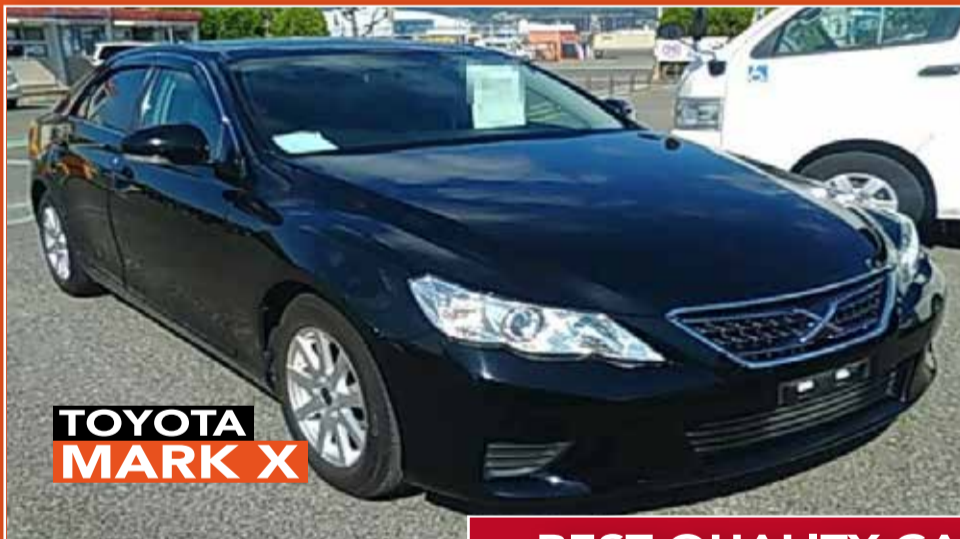
TOYOTA MARK X