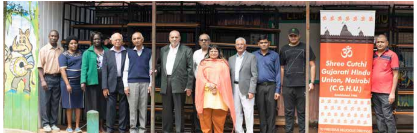
The Shree Cutchi Gujarati Hindu Union, Nairobi conducted a CSR Activity on 16 th June 2019 by donating school desks for children at the Ruben School in Ruben Centre in Nairobi. The school caters for over 2400 children and the principal of the school appreciated the kind gesture.

It was a very emotional moment for the seniors of the community as they journeyed through time during the play and were reminded of the hard and difficult times faced by their parents. Overall the play was commended highly by those who attended and many more requests for another show were made.