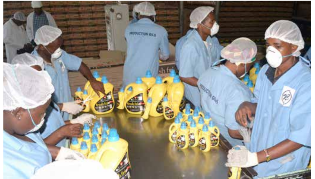
Pwani oil staff perform quality assurance checks for the company's new spout and tamper proof seal Fresh Fri cooking oil. The Mombasa based oil and soap maker has introduced into the market refreshed look and tamper free packaging.