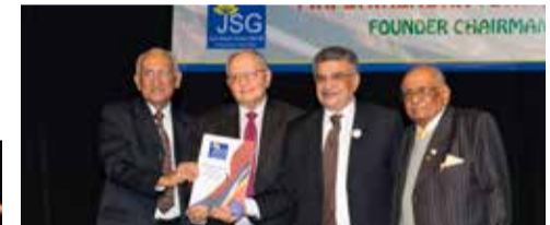
The JSG Souvenir unveiling by the Dignitaries