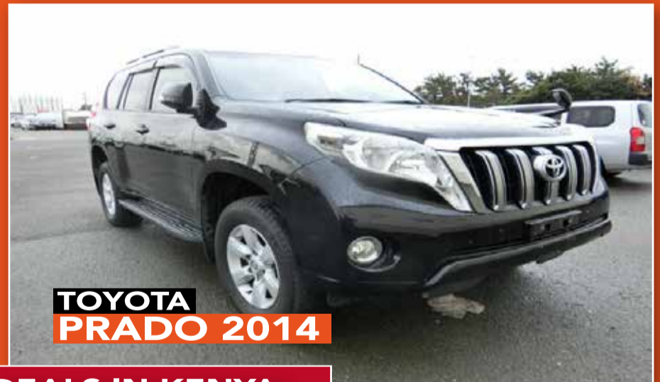
TOYOTA PRADO 2014