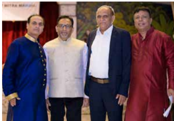
Few of the boys who participated in the Samuh Janoi function