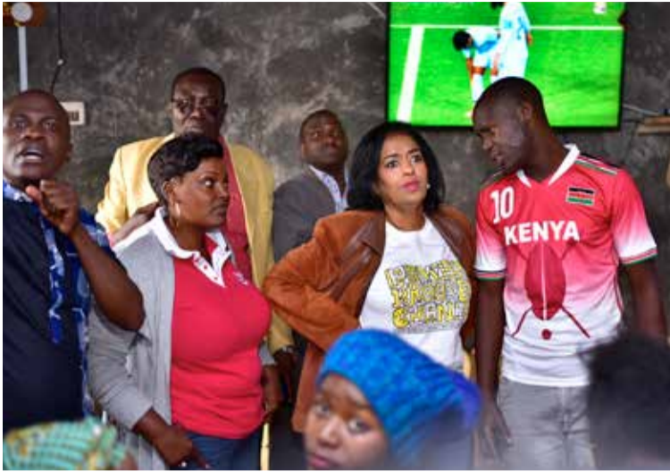
TALK TO YOUTH: Nairobi Women Rep Esther Passaris talk to members of Githembe Youth Self Help group at Githembe in Ngando Ward in Dagorreti in Nairbi County shortly after launching their TV Centre funded by The National Government Affirmative Action Fund (NGAAF) which falls under the Ministry of Public Service, Youth and Gender Affairs. The project is expected to flourish and generate capital for group during the 2019 Africa Cup of Nations.