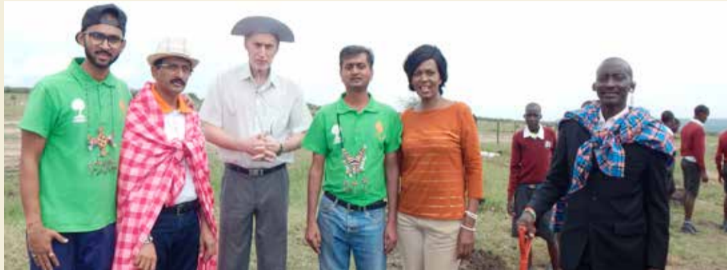
TREE PLANTING AT SEKENANI MASAI MARA REGION. It was a joint program with Israel Embassy and Green Clean Mara NGO. Hindu religious service center was proud to associate with Green lean Mara organization to plant trees in 8 schools across the Sekenani area. Together with Hindu Council of Kenya and Doshi Group we pledged 700 trees to be planted across the Schools. They were other associated partners contributing to Tree planting, furniture distribution, training children for the schools. The Tree planting programmed was accompanied with The Israel Embassy to Kenya Ambassador. Noah Gal Gendler together with his wife and fellow associated delegates who came for the event from Israel. It was a well organized event with keeping in mind key conversation of Environment and a responsible approach from the school to continue planting trees for betterment of the Community and Country at large. Tree planting was done on 6th and 7th Jun of 2019.