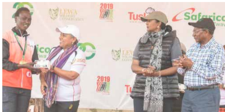
First Lady Margaret Kenyatta at LEWA, Meru County, 29 June 2019

First Lady Margaret Kenyatta was among the 1400 runners who participated in the 20th edition of the Safaricom Marathon in the Lewa Conservancy early today. The event, which has grown over the years to become an international attraction for conservation enthusiasts, attracted a rich mix of elite and amateur runners from over 30 countries who participated in the 42 kilometres full marathon, 21 kilometres half marathon and 5 kilometre race which the First Lady took part in.