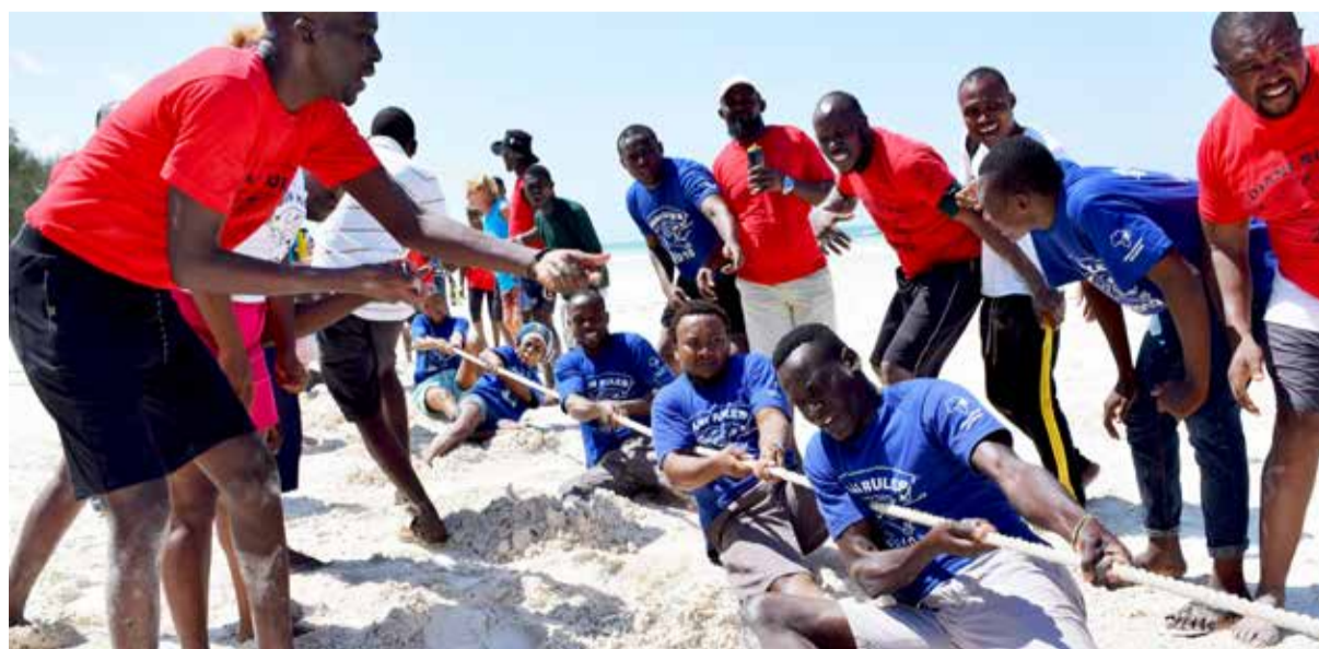
Diani Rules is an annual Team Building event started 29 years ago by a few people thought it would be a good idea to bring people to the coast during the low season for some fun and to raise money for a worthwhile cause. It is always held on the Madaraka Day