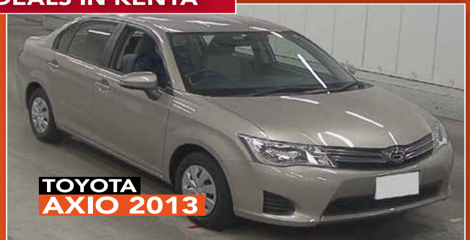
TOYOTA AXIO 2013

First cash buyer before end of April will get a full fuel tank free.