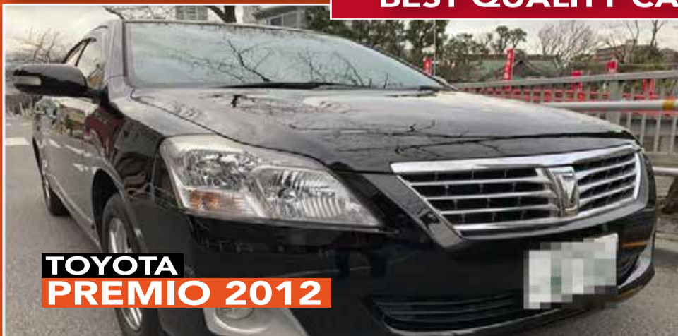
TOYOTA PREMIO 2012