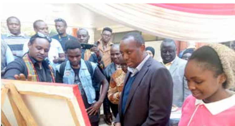
The PS Ministry of Sports is flanked by artists as he admires a painting during the 7 th Art and Culture Festival at the National Museum sponsored by The National Government Affirmative Action Fund.